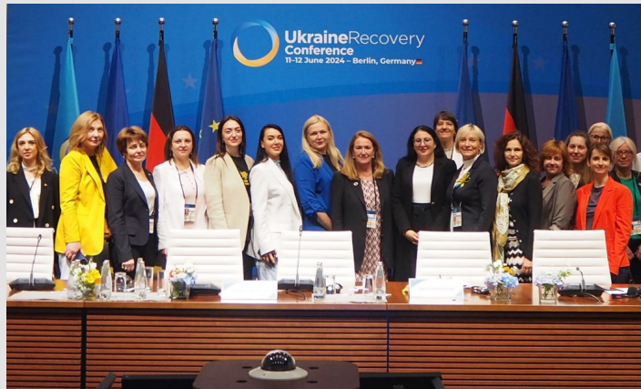
Women in energy: Representatives of the energy sector from the fields of politics, business and civil society met at the Ukraine Recovery Conference 2024 in Berlin.

The Energy Partnership supports the efforts being made to decentralise Ukraine's energy system and integrate the country into the European grid. At the same time, it is assisting with the green recovery of damaged energy infrastructure, thus contributing to the transformation of the energy sector. While Russia's war of aggression continues, it is supporting Ukraine through a donation and procurement campaign that supplies crucially needed equipment to maintain and repair the country's energy infrastructure. It also organises events, academic studies, delegation visits and PR activities to promote dialogue between policymakers and experts.