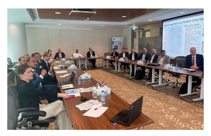
Visit of German delegation to Doha, kick-off meeting with Qatar Energy.

In the context of the 28th UN Climate Change Conference, the Qatari non-profit organisation Al-Attiyah Foundation reached out to the energy partnership to involve experts from the BMWK in a panel discussion on the topic of voluntary carbon markets (VCM). VCMs are gaining importance in the Gulf region as several countries are exploring carbon pricing mechanism to accelerate decarbonisation. A spokesperson from the BMWK participated in the 28th UN Climate Change Conference side event hosted by the Al-Attiyah Foundation.