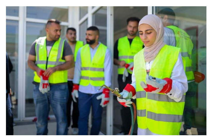
Trainees participating in HVAC and heat pumps training provided by the German Energy Academy in Jordan on 31 January in Amman.

The German Energy Academy (GEA) in Jordan, established in October 2021 with vital support from the BMWK, serves as a regional centre for upskilling in renewable energy, energy efficiency,