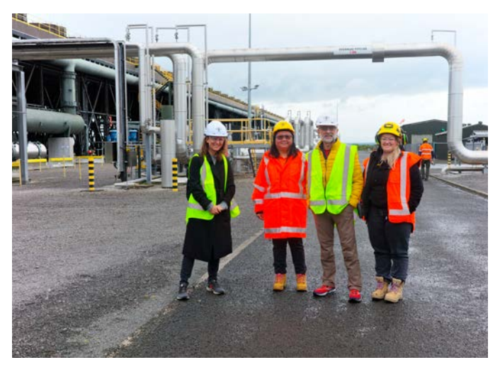
BMWK and adelphi visit Mercury Energy's Ngatamariki geothermal power plant in Taupo (October).

A major milestone in 2024 will be the release of a study to identify promising opportunities for collaboration in the broad area of decarbonising industrial sectors. Following this milestone, efforts will be directed towards implementing the recommended initiatives. Hydrogen is set to remain a central topic. Additional focus areas will shape up in accordance with developments throughout the year.