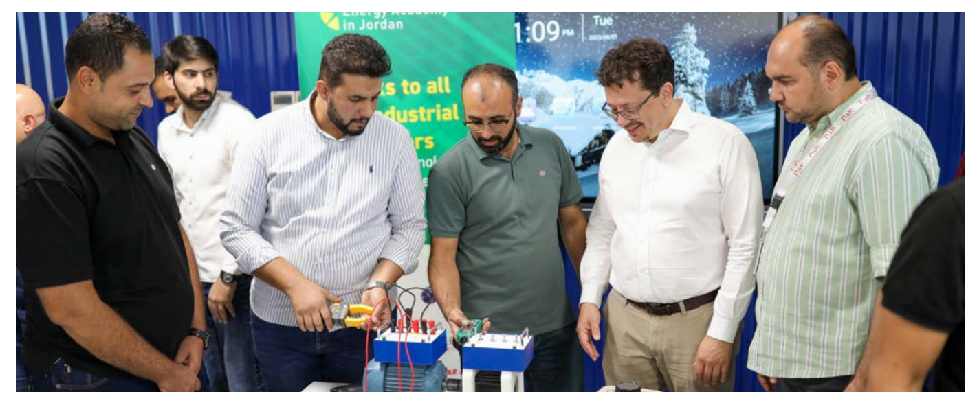
Trainees participating in a course on the energy efficiency of electric motors for industry provided by the German Energy Academy in Jordan on 1 August in Amman.

East as a junior application engineer upon completing her training. Her trajectory is one of many inspiring examples, highlighting the programme's role in breaking down gender barriers and paving the way for women to excel in renewable energy.