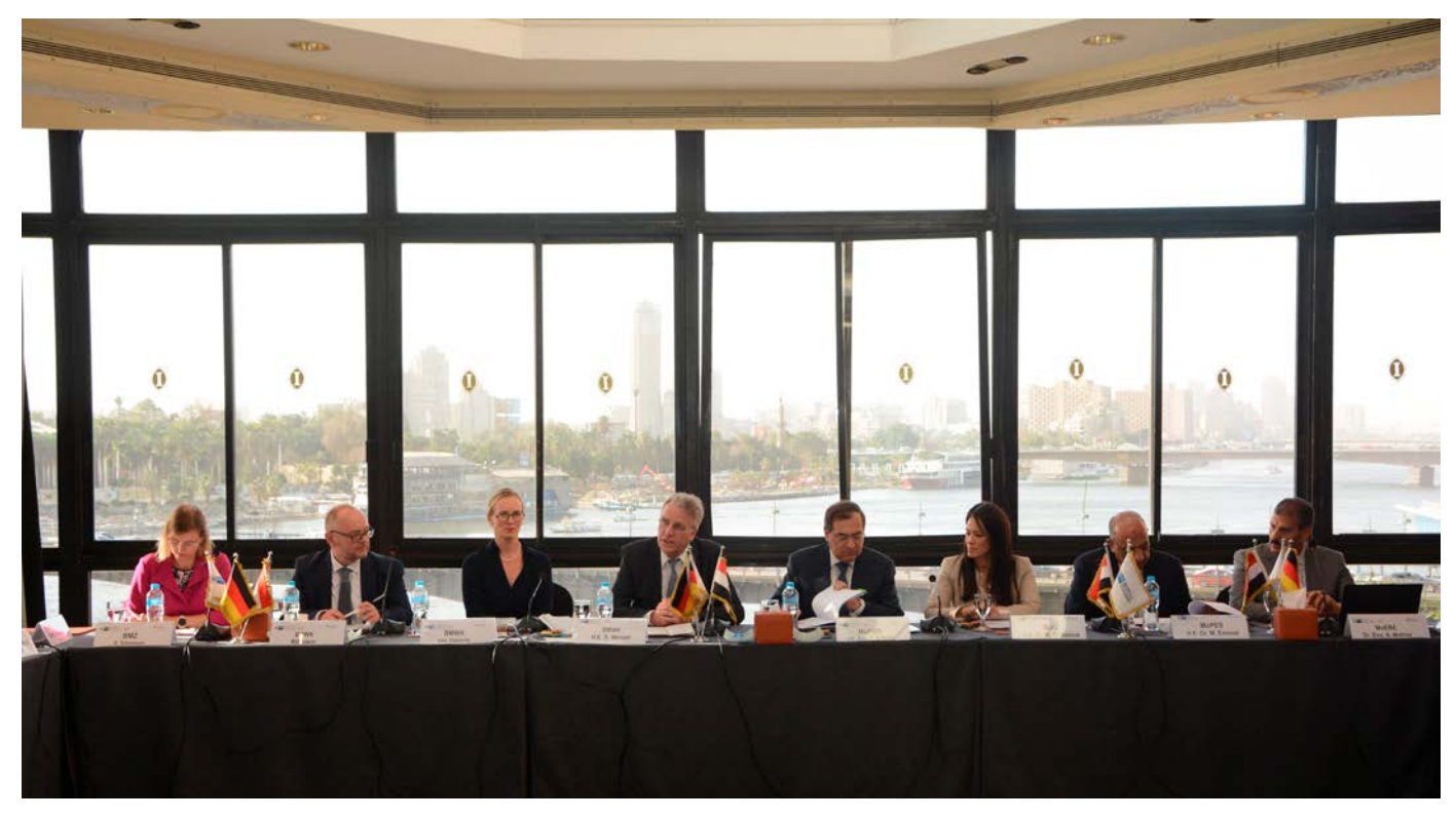
German delegation and representatives from Egyptian ministries at the first high-level steering committee meeting on green hydrogen/LNG (March).

Representatives from the Egyptian ministries and further organisations, the German embassy, the EU, GIZ and the Institute of Energy Economics at the University of Cologne (EWI) present the study "Towards a Green Shipping Gateway – Establishing a Green Hydrogen Economy in Egypt", at a diplomatic symposium in Cairo. The study was financed by the German Foreign Office (October).