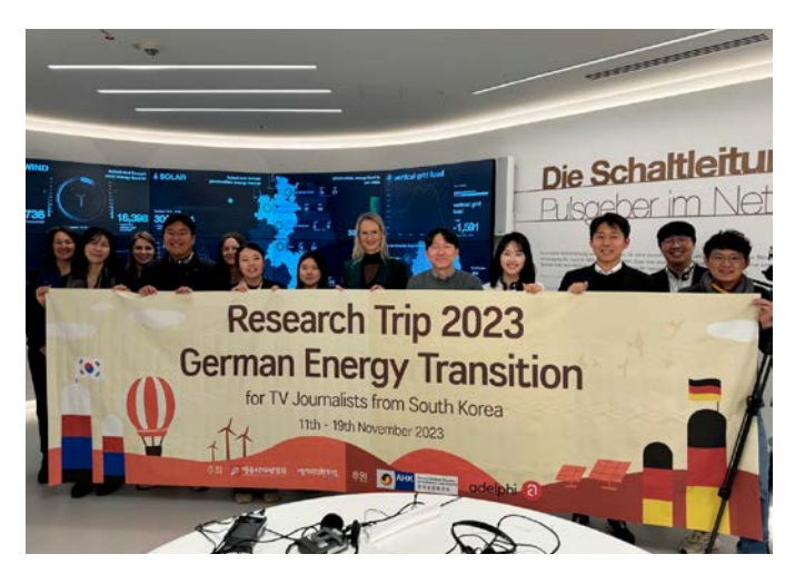
Korean journalists visit TenneT during a study tour to Germany (November).

Additionally, a comparative study prepared by adelphi and presented at the Korean-German Energy Day in Busan in May, gives a comparative overview of the potential that Korea and Germany have regarding different renewable energy sources. The study shows that contrary to preconceptions existing in Korea, the country has great potential to produce renewable energy within its borders given the right regulatory framework. Korea also has a higher solar PV potential than Germany per square metre and substantially higher potential for offshore wind energy, given its roughly eight-times greater marine area.