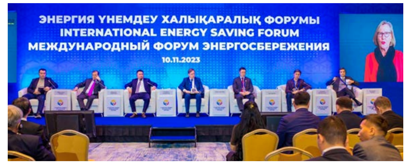
The Kazakh-German Energy Dialog as founder and initiator of the renowned EEF Forum in Astana.

which meets regularly and promotes Kazakh-German hydrogen cooperation in addition to working on the content of the strategy.