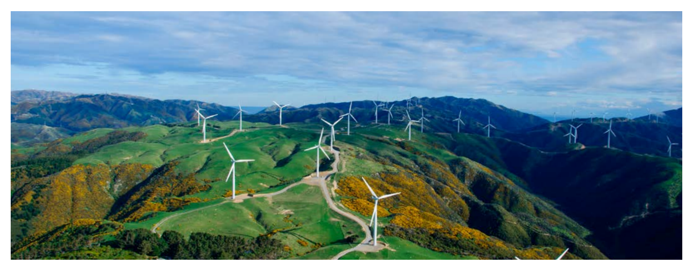
New Zealand has great potential for both on- and offshore wind.

cooperation. Presently, the priorities of the newly elected New Zealand Government are beginning to take shape.