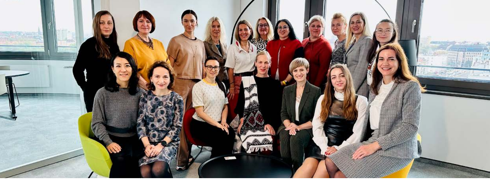
Members of the Women's Energy Club of Ukraine (WECU) at a networking event with BMWK, German-Ukrainian Energy Day in Berlin.