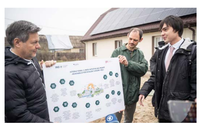
Vice Chancellor and Federal Minister Robert Habeck visiting Ukraine in April, presentation of R2U project.

The Promotion of Energy Efficiency project, backed by an additional €7 million from the BMZ, extended its reach to 25 partner municipalities, offering enhanced energy management assistance and capacity building through vocational education and training. The BMZ also allocated €50 million to the Green for Growth Fund, aimed at reducing energy consumption, resource usage and CO<sub>2</sub> emissions in Ukraine.