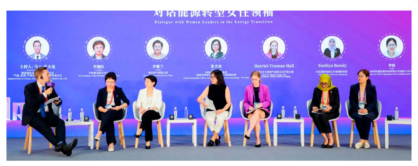
EP co-hosting the FIRST women empowerment subforum at high-level energy transition forum in China (September).

Increasing energy efficiency through energy efficiency and low carbon networks (EEN)