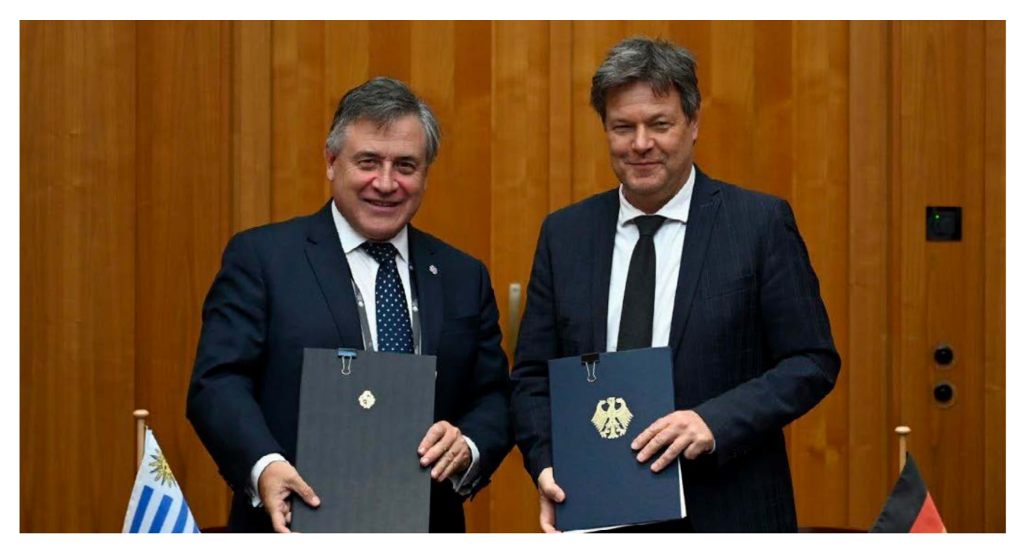
Signing of the energy partnership between Germany and Uruguay (Minister of Foreign Relations Paganini and Federal Minister Habeck).

through workshops, studies and strategic planning, demonstrating the synergy between German expertise and Uruguayan renewable ambitions. Together with partners from Uruguay, a work plan for the coming years was developed.