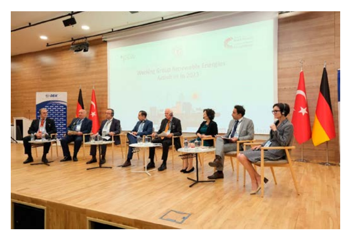
The co-chairs of the GTEP working groups present the progress of their work in a panel discussion at the fifth Turkish-German Energy Forum which took place in Ankara (October).

Its extensive networks enable the Turkish-German Energy Partnership to strategically engage with start-ups and key players in Türkiye's energy ecosystem. Every year, the Turkish-German Energy Partnership promotes participation in the Start Up Energy Transition (SET) award, an international competition for start-ups worldwide that are working on ideas to advance the energy transition and address climate change. This led to five Turkish start-ups being invited to join the SET Tech Festival in Berlin in March 2023.