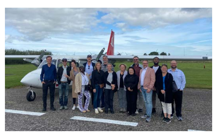
Delegates at the second offshore wind expert trip to Germany visiting an offshore wind site (September).