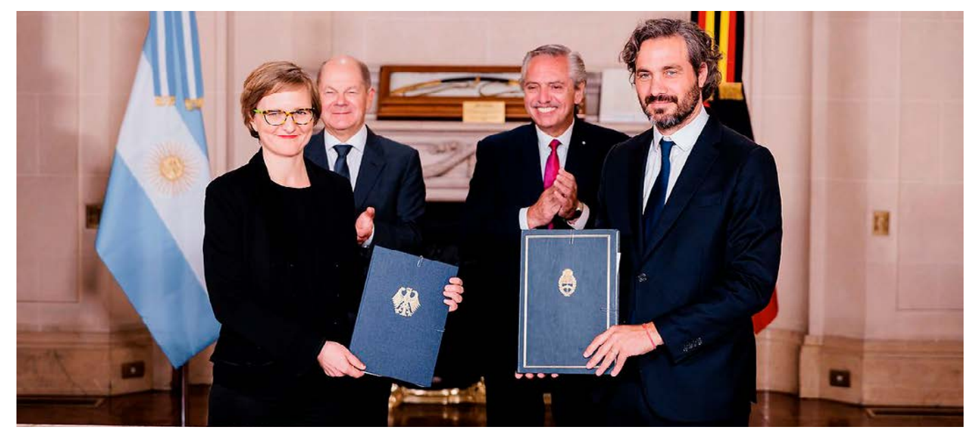
Signing of the agreement on the Argentine-German Energy Dialogue.

The dialogue was put on hold due to elections in autumn 2023 and will be taken up again with the new government in 2024.