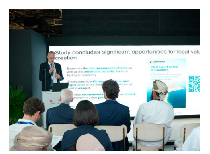
State Secretary Stefan Wenzel (BMWK) opening the Omani German joint side event at COP28.

Further key areas for policy cooperation include hydrogen policies, support schemes and certification, as well as power market liberalisation and the integration of renewable energy. There is also growing interest in discussing options for achieving Oman's Net Zero by 2050 target such as carbon pricing together with German counterparts.