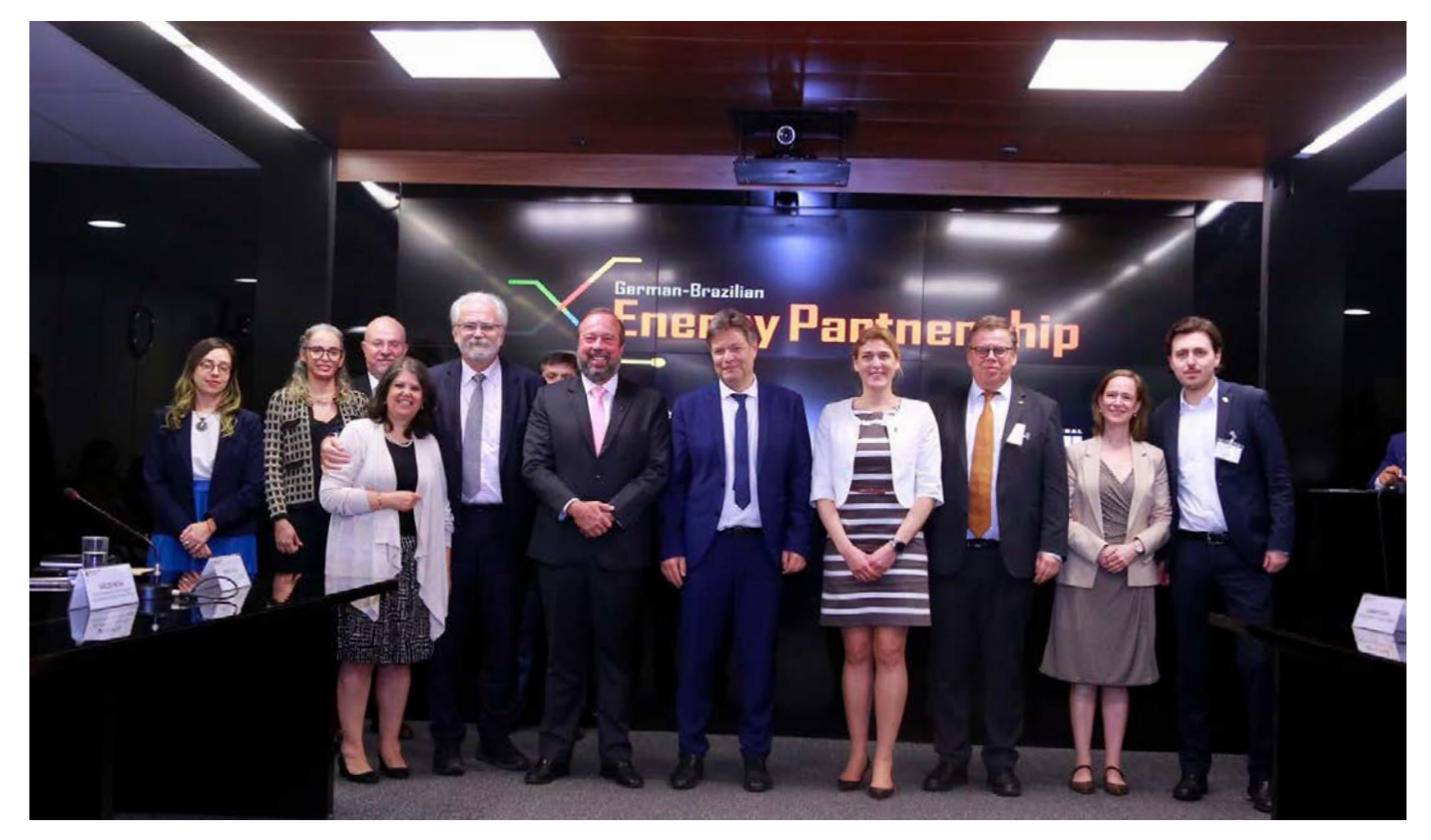
Signing of the joint communiqué in Brasilia, Brazil, affirming the Brazilian-German Energy Partnership (March).

The signing of the communiqué and the formation of the working groups underscored the commitment of both nations to collaborative efforts, enhancing communication about the energy transition and exploring mechanisms for making clean energy more affordable, thereby reducing dependencies.