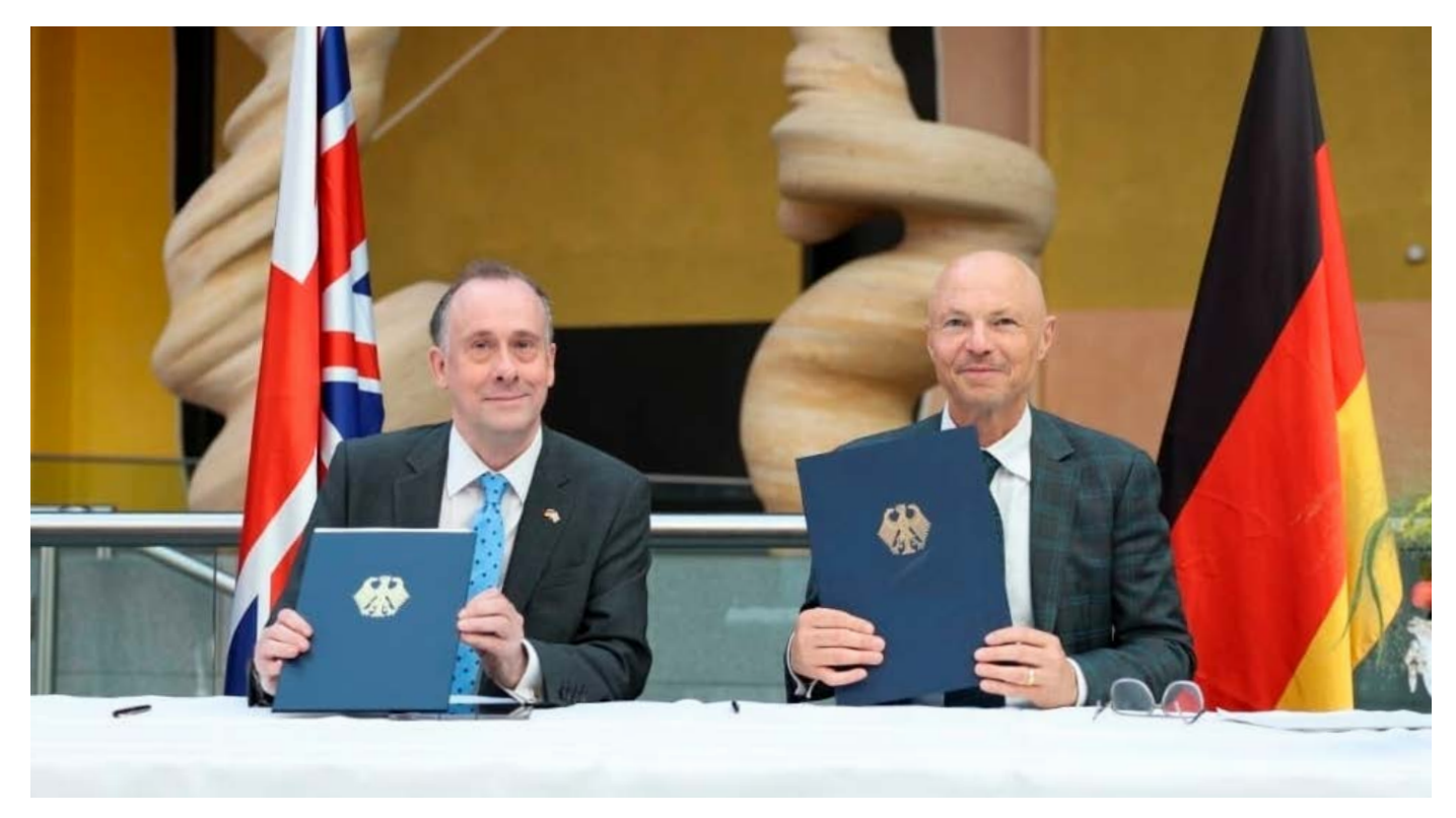
State Secretary Nimmerman with UK Minister for Energy Efficiency and Green Finance Lord Martin Callanan.

significant milestone in the global transition towards cleaner energy solutions for Germany and the United Kingdom. Both countries are committed to working together to facilitate the expansion of low-carbon hydrogen within their respective energy mixes, showcasing the viability of net-zerofriendly markets to the world.