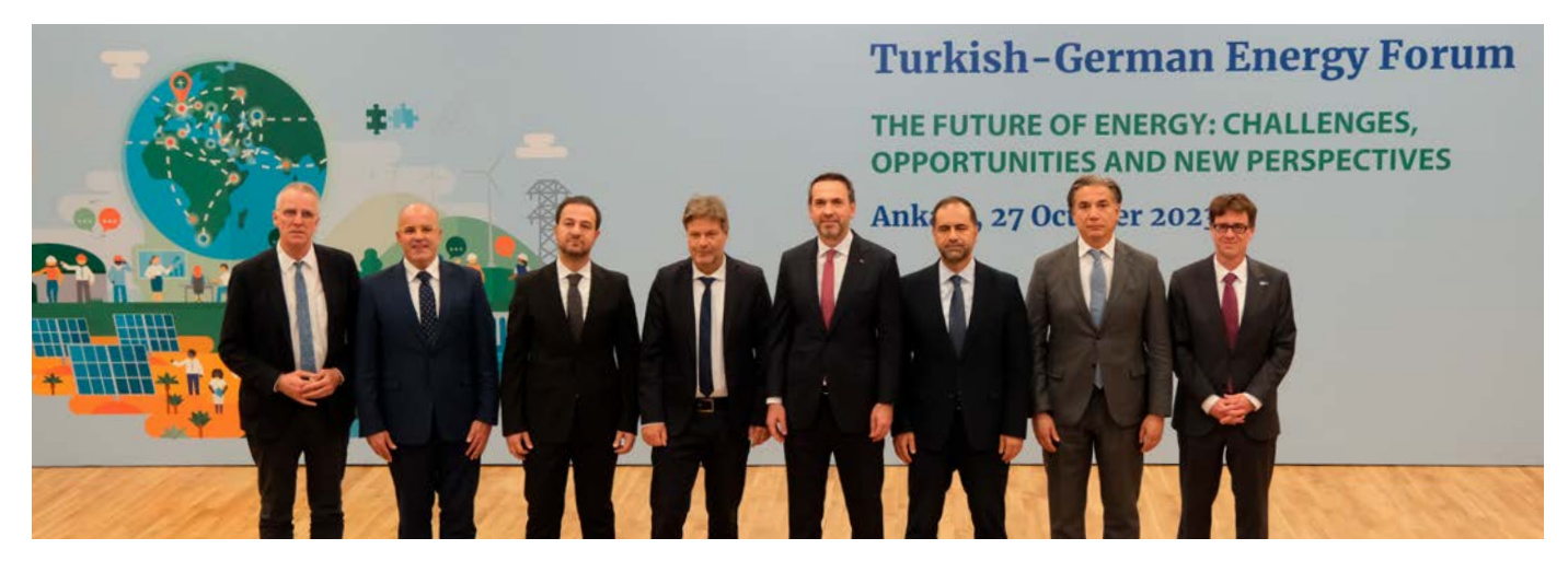
Participants at the signing ceremony at the fifth Turkish-German Energy Forum.

In the years 2021-2023, a total of five start-ups from Türkiye made it onto the SET100 list – the annual compilation profiling the best SET Award applications worldwide. Participating start-ups reported that attending the SET Tech festival in Berlin helped them to initiate new collaborations with German and European institutions and expressed a desire for similar events to take place in Türkiye. Building on this momentum, the Turkish-German Energy Partnership organised the first-ever Türkiye Energy Start-Up Day in Istanbul in November 2023. With 120 participants and four stimulating rounds of panels and pitches, the event amplified awareness of the Turkish-German Energy Partnership within the local ecosystem, created