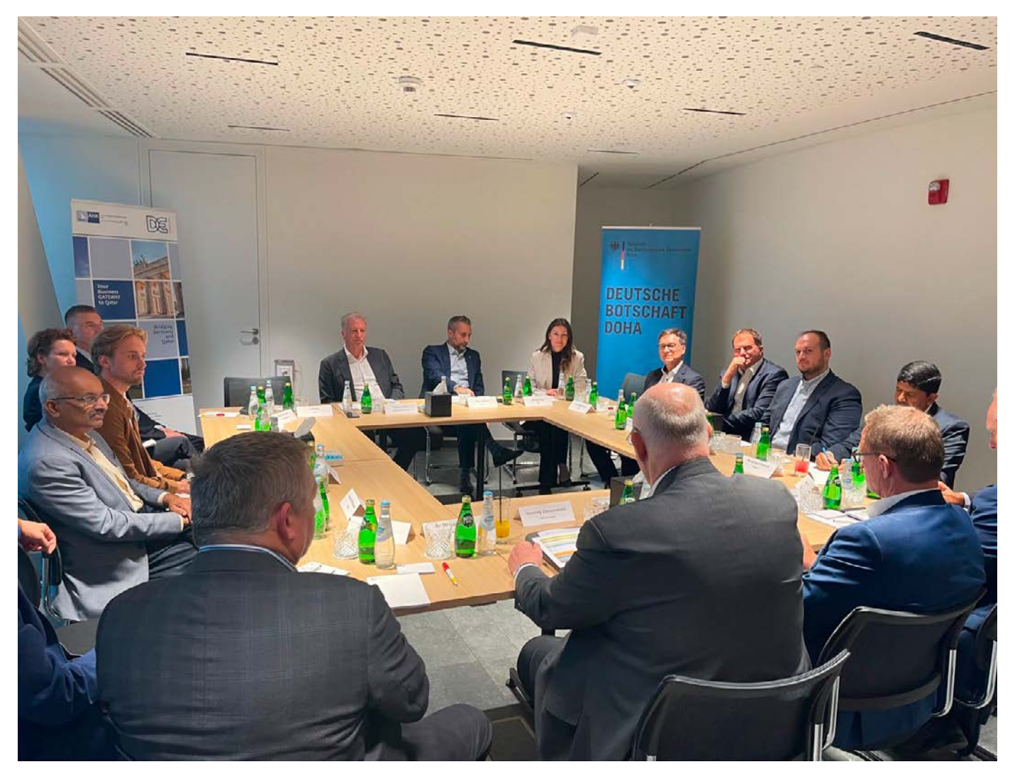
Visit of German delegation to Doha.