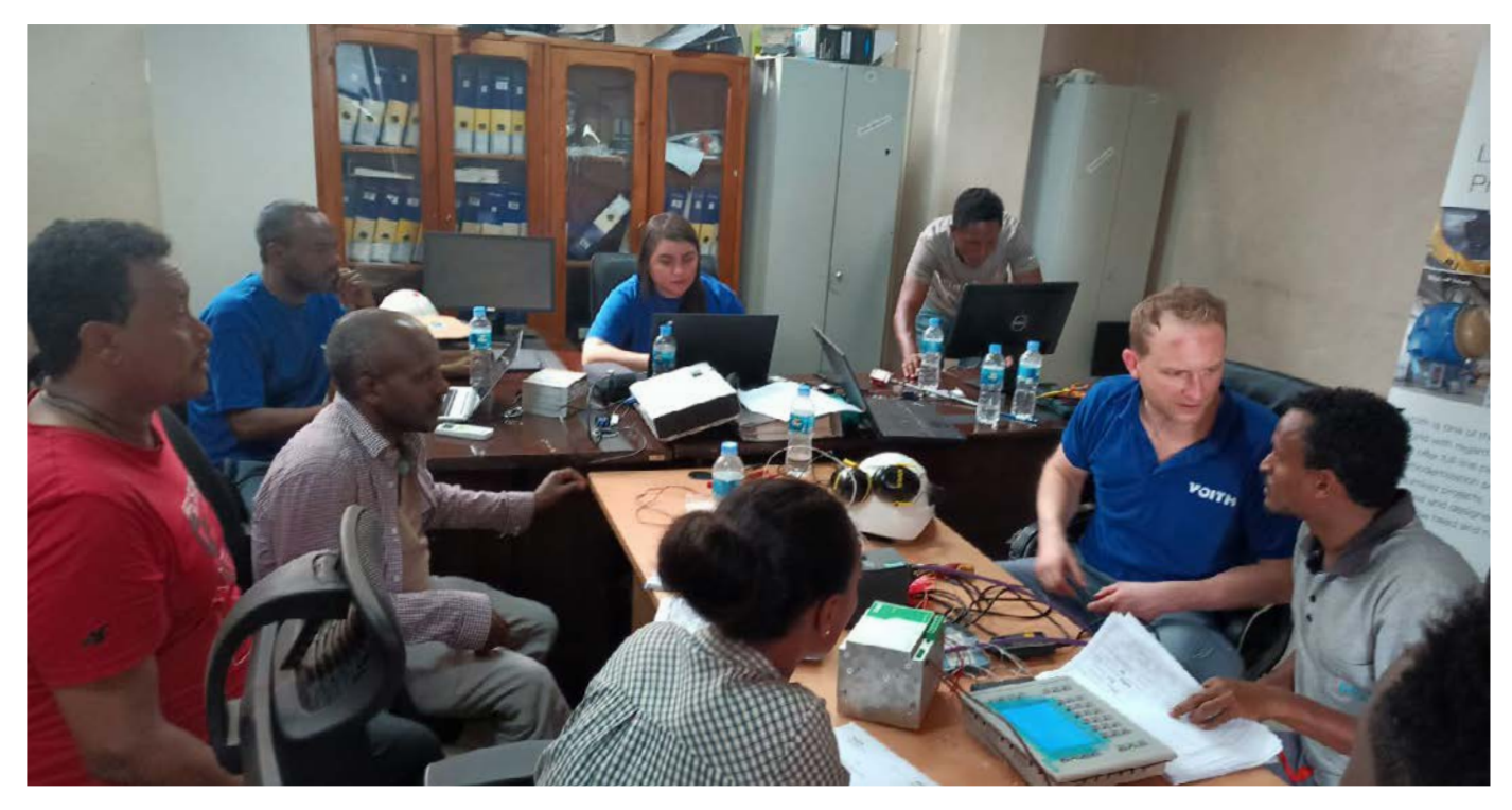
Hands-on training at Gilgel Gibe II hydropower plant, Gilgel Gibe.

holder engagement in the development of the National Sustainable Energy Development Strategy, the Technical Directive for Electric Vehicle Charging Facilities, as well as the establishment of a National Technical Committee on Energy Efficiency in Building, supporting the Ethiopian Ministry of Water and Energy (MoWE) and the Ethiopian Petroleum and Energy Authority (PEA).