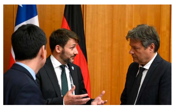
Bilateral meeting between Chilean Energy Minister Pardow and Federal Minister Habeck during the Berlin Energy Transition Dialogue (March).

The energy transition must consider social, political, economic and environmental variables in order to include stakeholders affected by this change. The inclusion of a gender equity perspective is fundamental, as the impact of climate change affects women and girls in a distinct and disproportionate way. On 10 May, the first Latin American conference on "Capacities for Change and Gender Empowerment in Energy (CEGEN LAC)" was held in Santiago de Chile, which brought together more than 100 political authorities and relevant experts from Latin America and Europe for the integration of women in the energy sector.