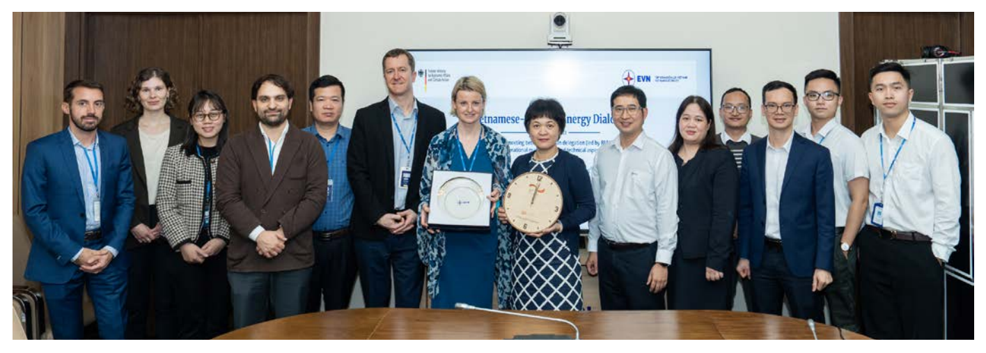
Bilateral roundtable meeting between German delegation and Vietnam Electricity (EVN) in February; attended by representatives from Vietnam Electricity (EVN) and the BMWK.

industry in Viet Nam were discussed, as was the question of how actual market developments should be aligned with current policy developments. Furthermore, Vietnamese developers were matched with German solution providers and agreed on joint efforts in and around green hydrogen, e.g., TÜV SÜD and The Green Solutions joint activities in the hydrogen sector in Viet Nam.