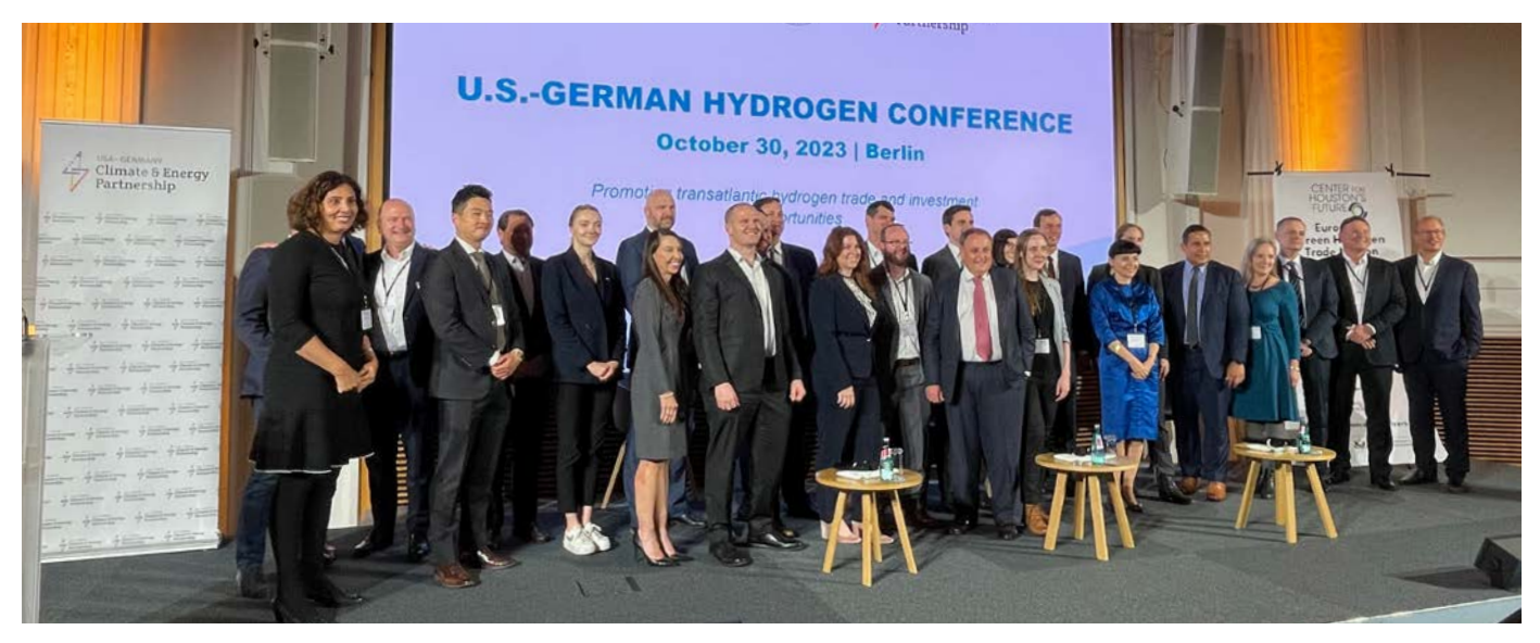
Panellists and US hydrogen delegation on stage at the US-Germany Hydrogen Conference in Berlin (October).

both organised in cooperation with the University of Minnesota.