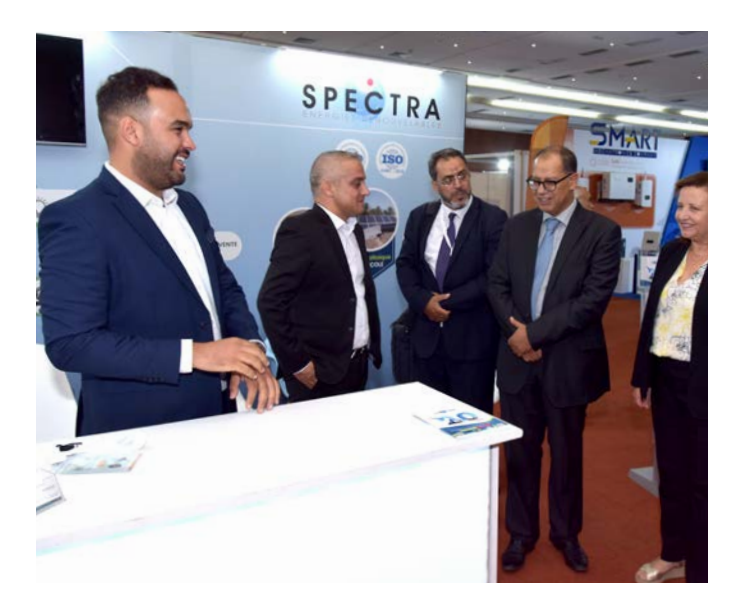
Lively discussions about the progress of the energy transition between the public and private sector took place at the second energy transition fair (October).

The Tunisian-German Energy Partnership supports the Tunisian solar association, CSPV, in its organisational development thereby reinforcing its role as an advocate for the advancement of the Tunisian energy transition. One of its flagship activities is the organisation of an energy transition trade fair in cooperation with the national association of private companies. The second edition of this trade fair took place in October under the Ministry's patronage and in cooperation with all key actors in the Tunisian energy sector.