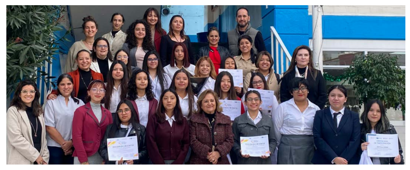
Participants of the Young Women Students Mentorship Programme in Renewable Energies (MMUJEER) receiving their certificates (Mexico City, November).

international best practices for a subnational energy transition led to the development of a toolbox that offers a practical guide for decision-making by subnational governments. An exchange of experience gained with regard to the Mexico City Solar Plan and the Berlin Solar City Master Plan facilitated the exchange of knowledge and strengthened the work relationship between the partner cities. Both cities have ambitious plans for increasing the installation of solar energy panels to transform their energy supply.